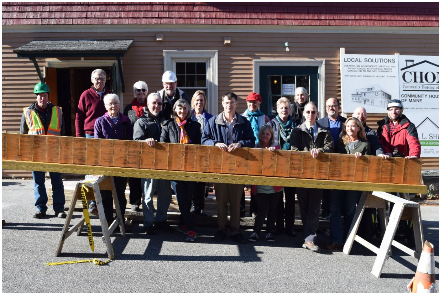
Representatives of Local Solutions, a group creating a supported living facility for local adults with disabilities, outside the former St. Saviour's parish house in November. Local Solutions has partnered with Brunswick-based Volunteers of America to provide staff for the facility.

(Printed from url= http://www.mdislander.com/maine-news/special-needs-home-hires-staffing-partner )