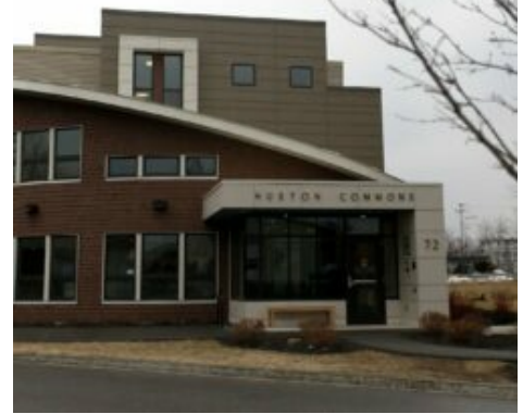
Huston Commons on Bishop Street is one of three site-specific "housing first" projects in Portland. The others are Logan Place and Florence House. State lawmakers want to create more supported housing projects to fight homelessness, not just in Portland but in communities around the state.

Portland's primary adult shelter routinely exceeds capacity, forcing the city to convert space at a nonprofit into a sleeping area and sometimes also opening up a city office. Now, the city manager is proposing to turn people away once the first overflow space fills up, a potential reversal of a 30-year commitment to provide shelter to anyone who asks.