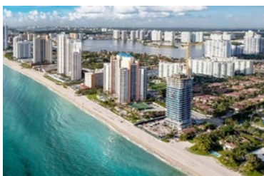
As the Market Strengthens, Miami Builders Look North