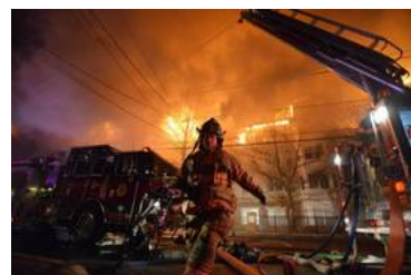
New Jersey Fire Officials Demand Tougher Code