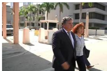
Contractors Plead Guilty in Affordable Housing Scam