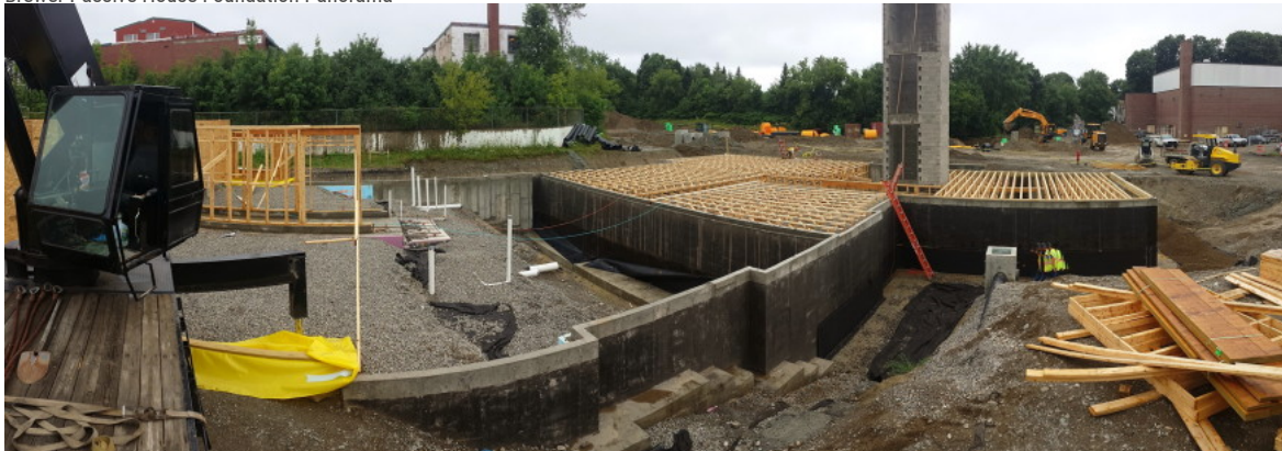
Brewer Passive House Foundation Panorama

At the foundation stage, the Brewer Passive House multifamily building looks much like any other apartment building. But implementing good air-sealing details now will be key to the building's final performance and certification.